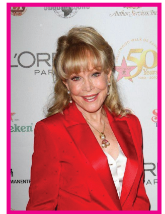
Acclaimed Actress Barbara Eden

Barbara Eden has been named one of "America's 200 Greatest Pop Culture Icons of the 20th Century" by People Magazine and one of TV Guide's "Most Popular Comedy Television Stars." Her extraordinary accomplishments have been honored with a "star" on the Hollywood Walk of Fame and she recently starred in "Love Letters" with Hal Linden. This spring, her much anticipated autobiography titled, "Jeannie, Out of the Bottle," will be published with great acclaim.