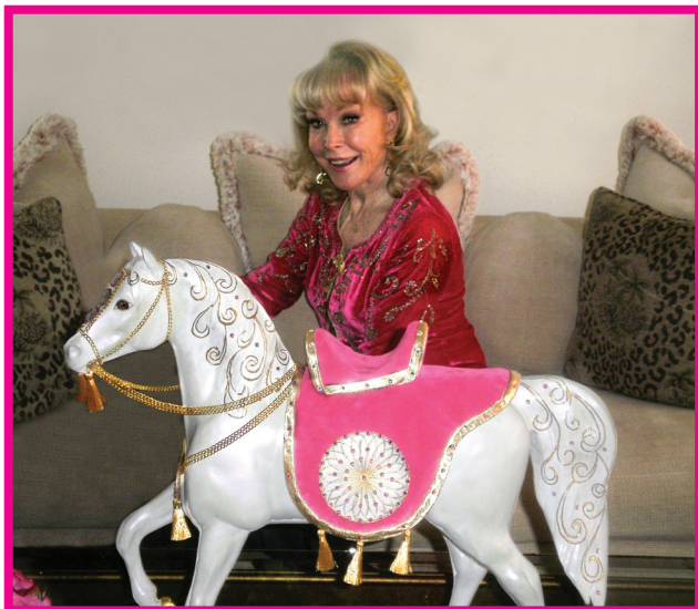
Left: Barbara Eden and her Original Painted Pony, "Dreamcatcher"