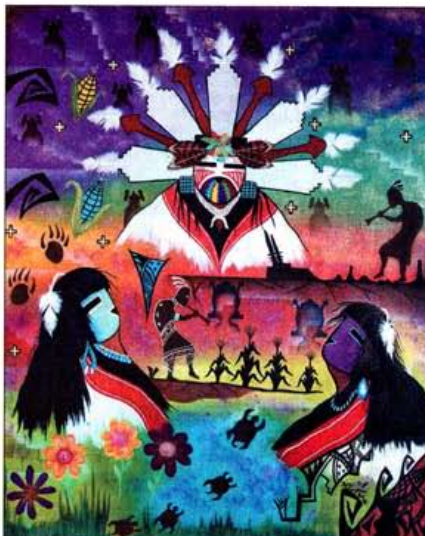
FOUR SEASONS RESORT SCOTTSDALE AT TROON NORTH

The American West means different things to different people, says Keyes, even among the artists featured in the collection.