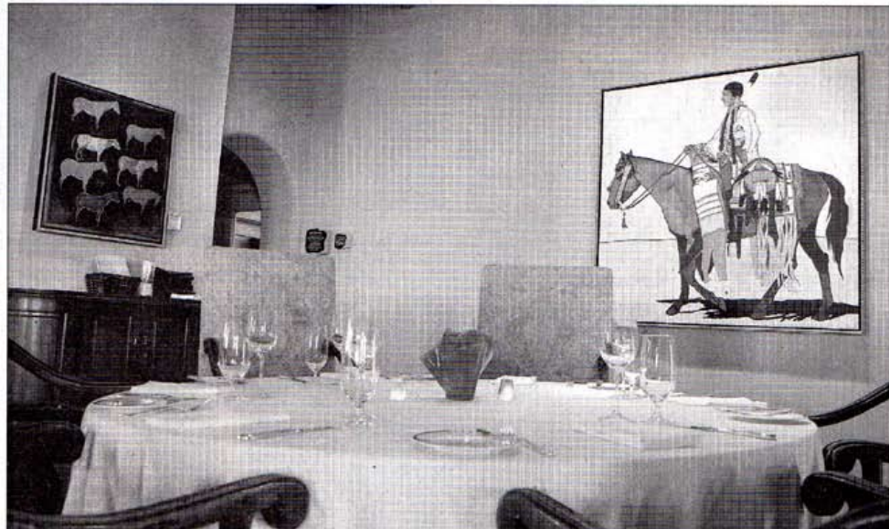
LIVING GALLERY: The exhibit's Western-inspired art adorns the walls of Four Seasons Resort Scottsdale at Troon North.

"We have a strong faith in more or less the unknown, the spiritual world," says the Phoenix resident. "These paintings that I do are the messengers