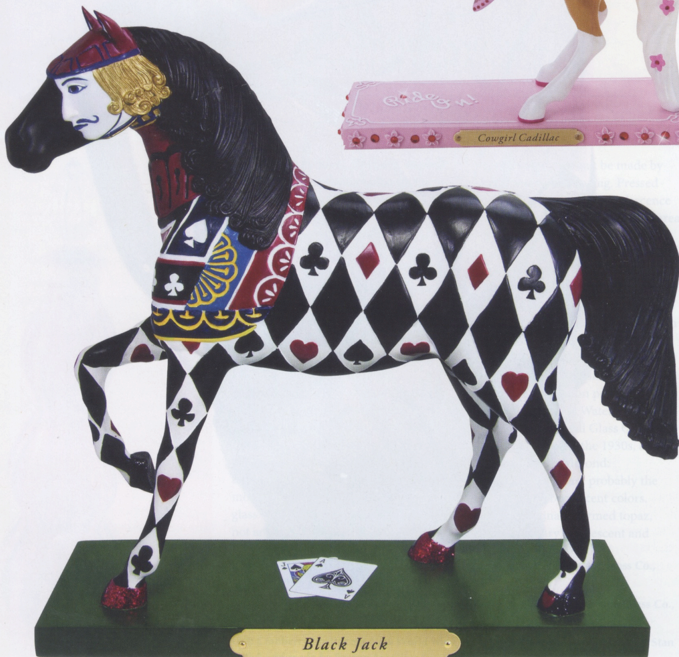
"Black Jack" by Karlynn Keyes, The Trail of Painted Ponies, Item 4034630, resin, 2013