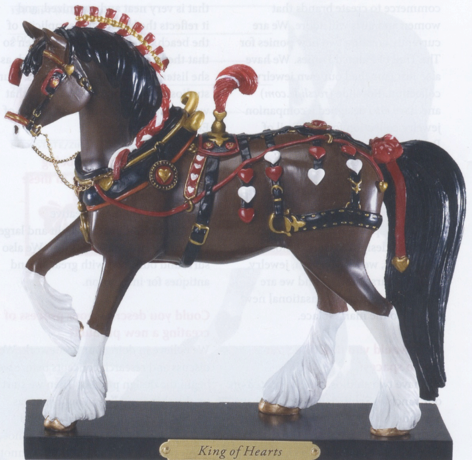
"King of Hearts" by Karlynn Keyes, The Trail of Painted Ponies, Item 4024357, resin, 2011.