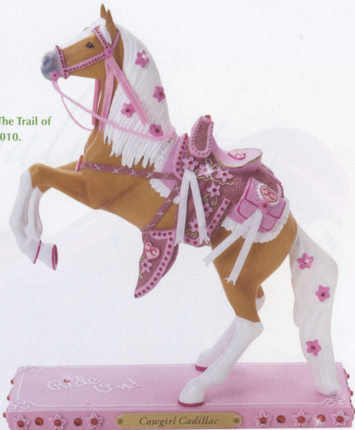
"Cowgirl Cadillac" by Karlynn Keyes, The Trail of Painted Ponies, Item 4020476, resin, 2010.